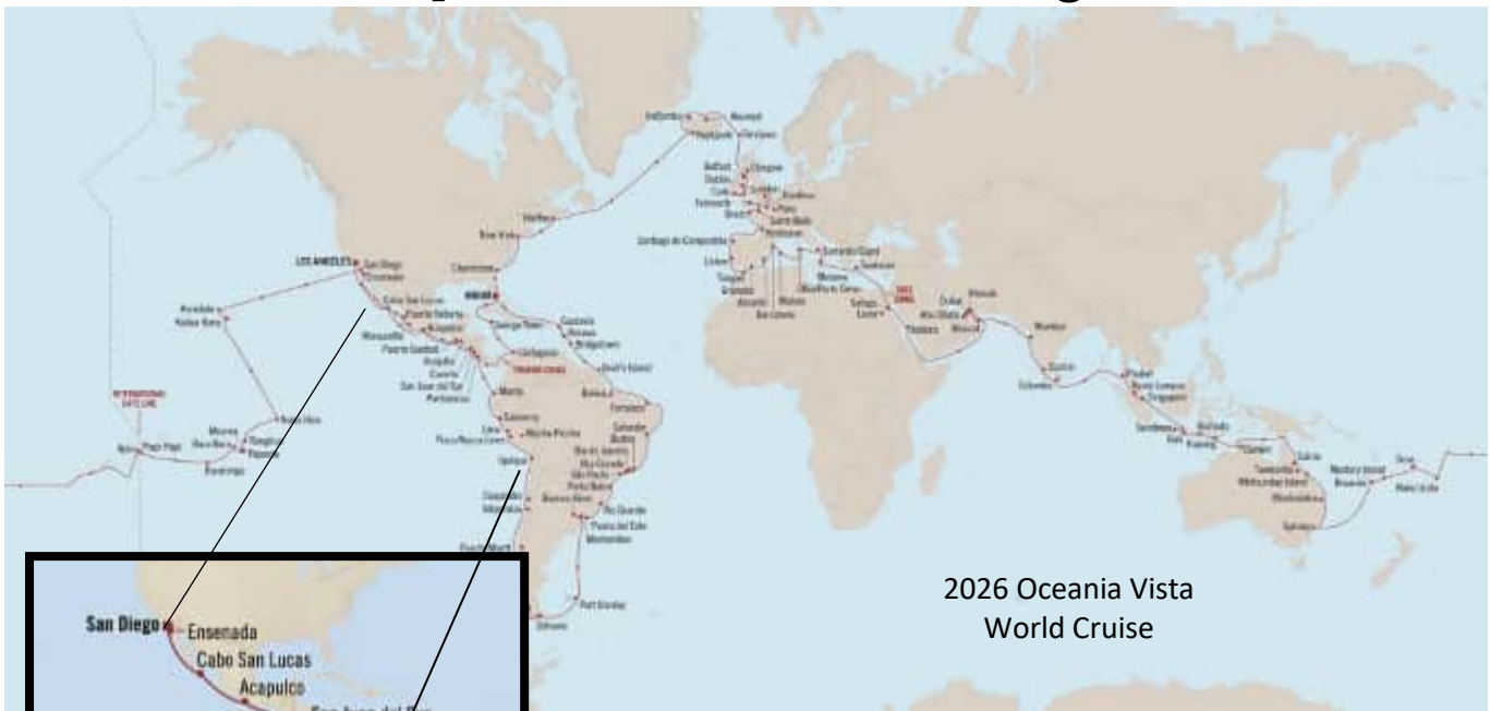
2026 Oceania Vista World Cruise