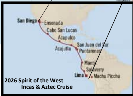
2026 Spirit of the West Incas & Aztec Cruise